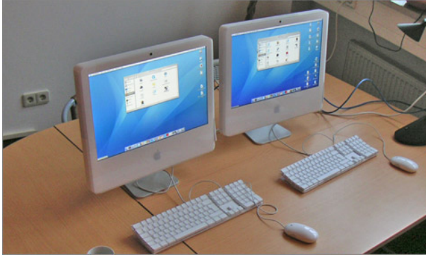
fig 6.1 - These Mac's look the same, but but they are completely different inside.

The Intel transition is now completely underway, with many systems using the CoreDuo and CoreSolo processors. Lab administrators have to take this transition head-on. One of the main disadvantages of the current builds of OS X is that it is architecture specific. In other words, there are two versions of OS X; OS X Power PC, and OS X X86. Although 10.5 Leopard should be a universal operating system, as of now we need to make two of everything. This section will guide you through the Intel transition in regards to NetBoot and NetBoot deployment systems.